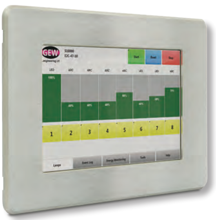
RHINO touch panel

GEW is the only UV supplier to guarantee their system for 5 years.